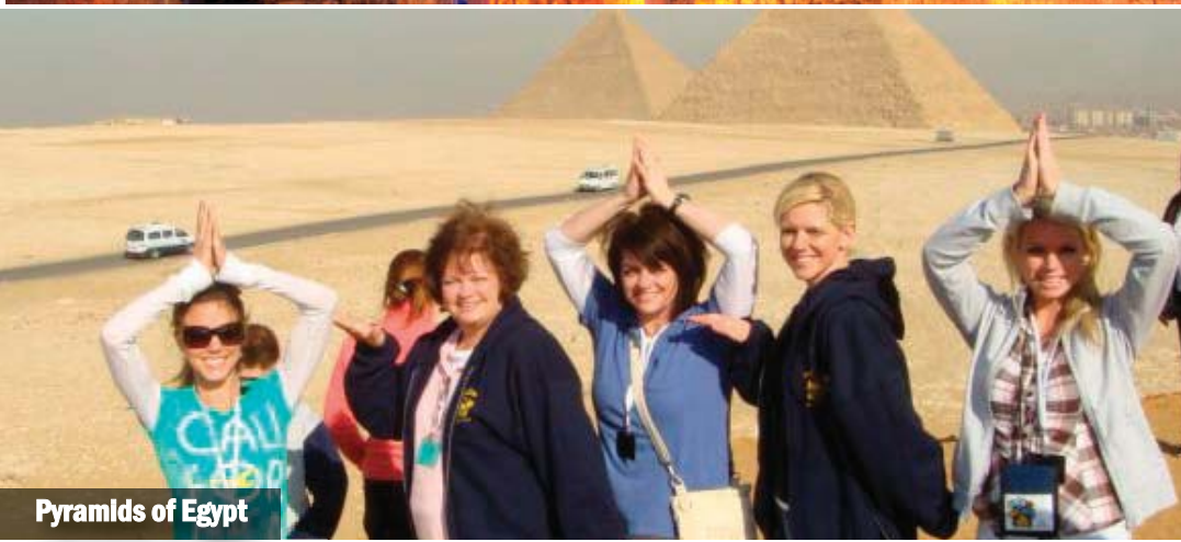
Pyramids of Egypt

Jerusalem...the city of the great King (Matt. 5:35)